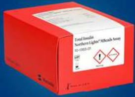
Insulin (Total) MBeads Assay