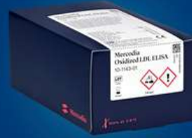
Oxidized LDL ELISA