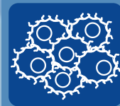
Cancer and apoptosis