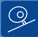
Cell adhesion & ECM