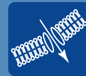
Cell permeable & Cell penetrating