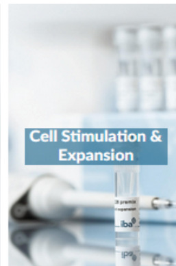
Cell Stimulation & Expansion