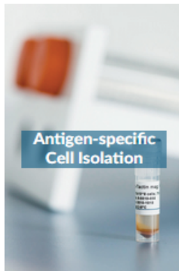
Antigen-specific Cell Isolation