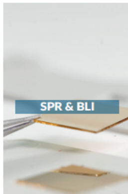
SPR & BLI