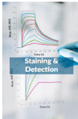
Staining & Detection